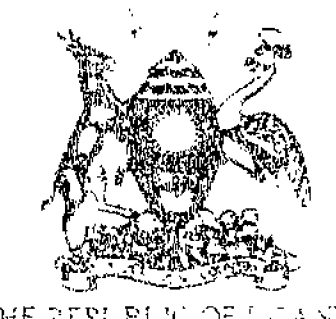
THE REPUBLIC OF UGANES